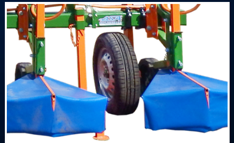
DEPTH LIMITING WHEEL