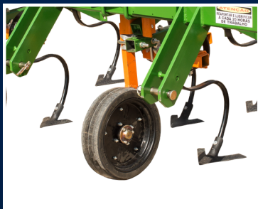
DEPTH ADJUSTING WHEEL